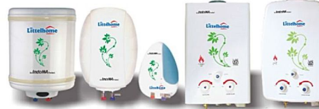
ELECTRIC GEYSERS / GAS GEYSERS