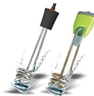
IMMERSION WATER HEATER