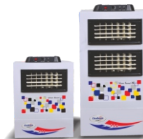
HAWA HAWAI COOLER