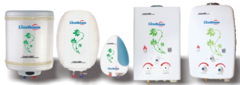
ELECTRIC GEYSERS / GAS GEYSERS